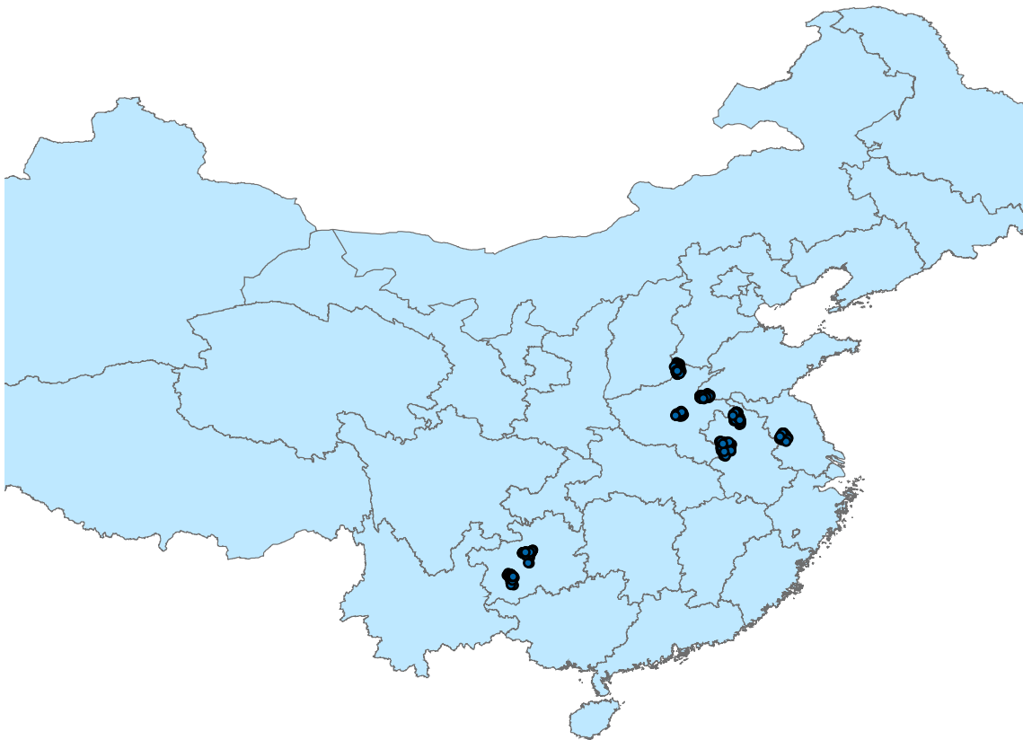
Figure A.1: Provinces and Counties Where RCT Was Implemented

Notes: Map shows the location of our eight RCT counties in the three provinces of Anhui, Guizhou and Henan. The dots indicate participating villages and the boundaries indicate Mainland Chinese provinces. Section 2 and Appendix E for discussion.